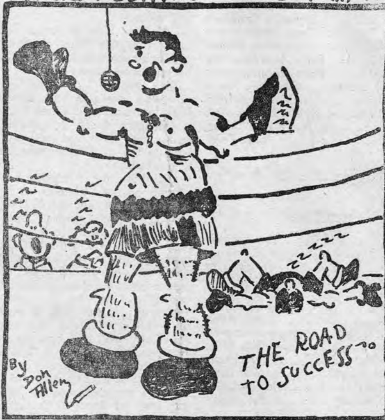
DOM SIMERIE AFTER TAKEING PUBLIC SPEEKING!